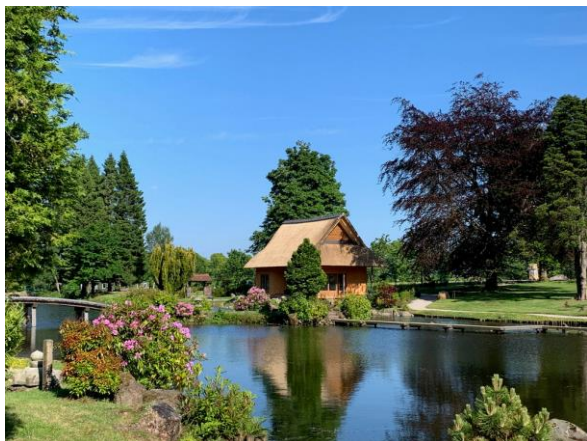
Fig 2 Scenic view of Japanese Garden

This will take form of the "Annual Coach Trip by Car" which visits The Japanese Garden at Cowden Castle near Dollar, on Saturday 6th August 2022. This is not an official, organised trip at all. DBHS is recommending the Japanese Garden as a