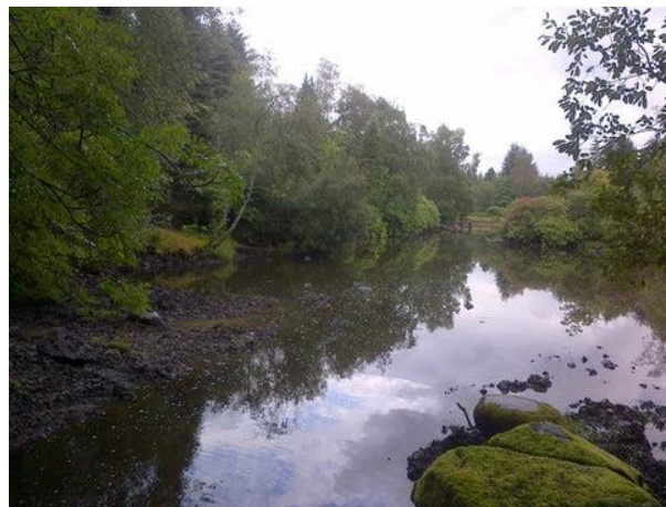
Fig 3 West Islands before Restoration