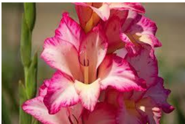
Fig 6 Gladiolus