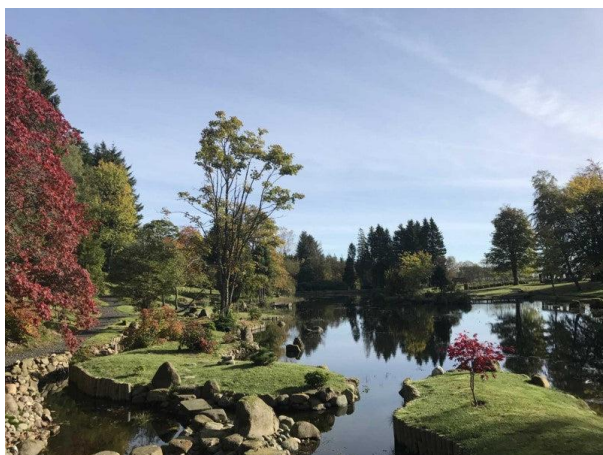
Fig 4 West Islands after restoration

special place to visit. There will be no arrangements to travel by coach or even by car. If you want to go, you must travel there and back under your own steam. Tickets are £8.50 and the garden opens at 10:30am and closes at 4:00pm. Look up info@cowdengarden.com for more information.