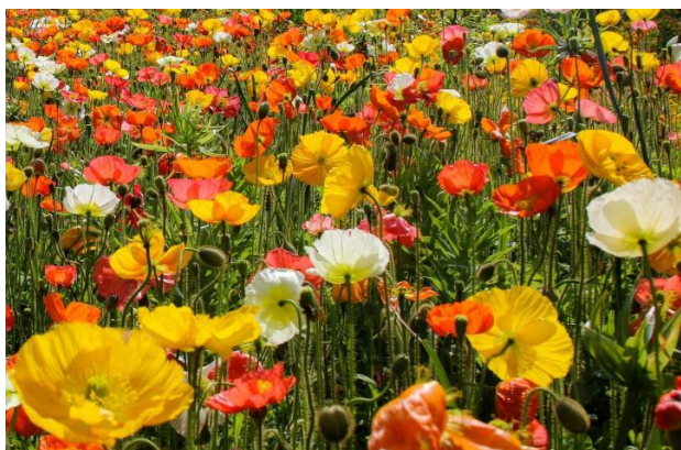
Fig 7 Poppies

August has two birth flowers the gladiolus and the poppy, both symbolize remembrance. Both come in a variety of colours.