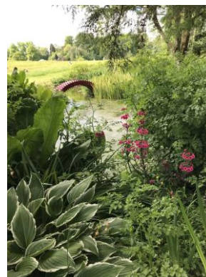
Figure 5 Riverside view of red bridge (These little red bridges are very steep and difficult to cross)