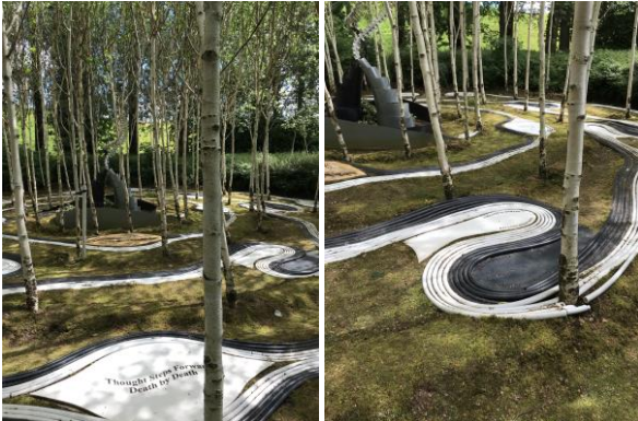
Figure 8 Birch Bone Garden (each of the swirls is imprinted with thought provoking quotes)