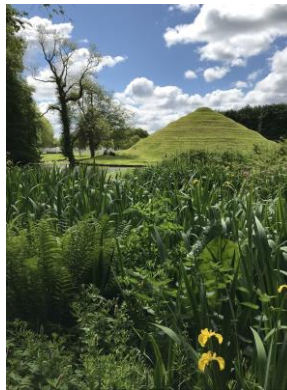
Figure 2 Snail Mound