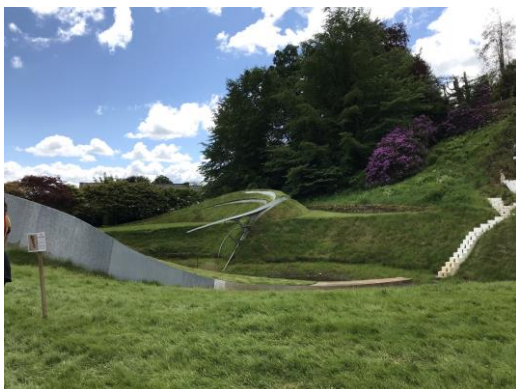
Figure 10 Part of Serpent Mound