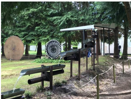
Figure 9 Exaptation Garden