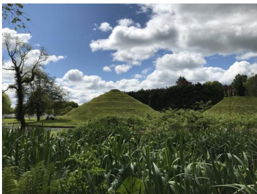
Figure 1 The Snail Mound

The Garden of Cosmic Speculation had it's annual opening for Scotland's Garden Scheme and Maggie's on the 28 th and 29 th May. I've copied the guide and attached it to the July grapevine email. These are some of my photographs from my visit there.