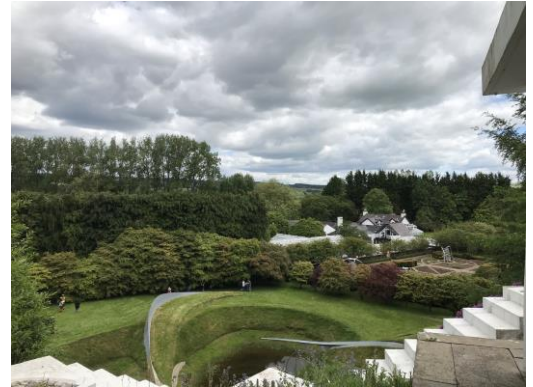
Figure 12 View from Top of the Universal Cascade