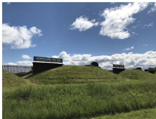
Figure 6 Rail Garden of Scottish Worthies (Robert Adam & James Watt only 2 of many)