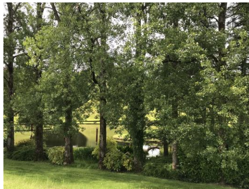
Figure 4 View of Snail Mound & Riverside from Rail Garden (the red flags record key events in Scotland's past)