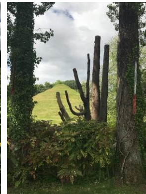
Figure 3 Snail Mound