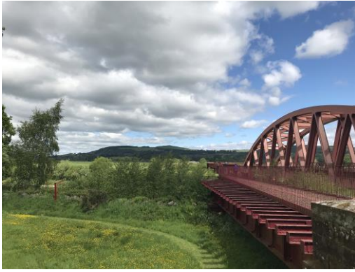
Figure 7 Red Garden