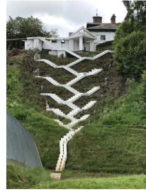
Figure 11 Universal Cascade